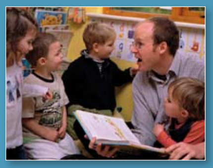
role play area Miss Polly had a